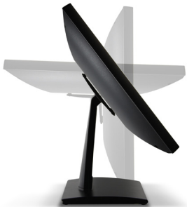
90-degrees of Adjustment