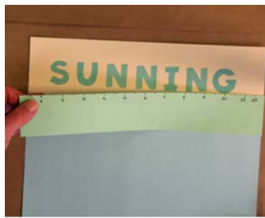
5) After the letters have been aligned, remove the paper ruler to leave a perfectly aligned and centred title on your scrapbook page.