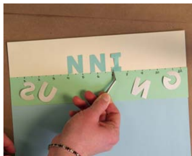
4) Place the tacky paper ruler on your page and using your tweezers, position the letters in place and press down to bond. It's easiest to work from the center of your title to the edges.