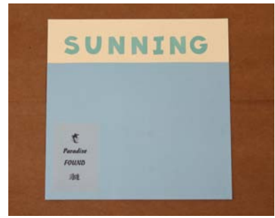
6) Perfectly aligned lettering has never been so easy. The page is ready for your family pictures from the beach!

The technique works best if a very light “repositionable” coat of adhesive has been used on the protective paper in Step 3. This holds your letters in place while you coat them with adhesive. Refer to the Special Techniques Tip Sheet for detailed instructions on repositionable coats of adhesive. Remember to have FUN and be CREATIVE!!