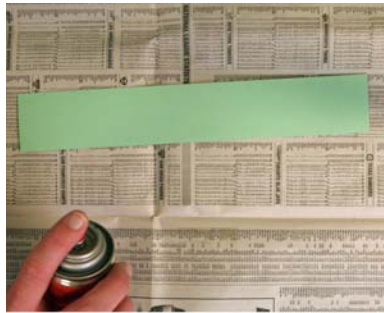
2) Spray a very light repositionable coat of adhesive on the back surface of the paper ruler and allow to dry. (see Special Techniques Tip Sheet).