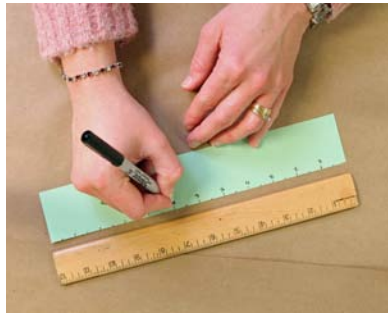
1) Create a temporary ruler using a strip of 12” card stock and a ruler.

For perfect lettering and scrapbook page banners, prepare a small area of your workspace with some protective paper and follow the steps below: